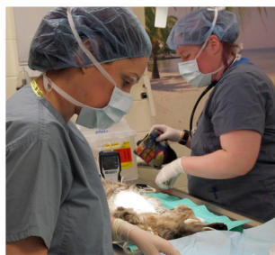
Feral Clinics are vital to controlling the unowned cat population.

Audited Financials Available for 2019, 2018, 2017, 2016, 2015, 2014