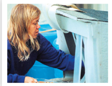
Founding volunteer cares for a waterfront feeding station.