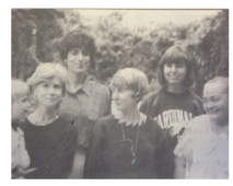
Newspaper clipping of MRFRS Founders circa 1993

A compassionate world where all cats live happy and healthy lives.